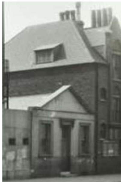
Camden Hall: LMA Collage 182225

More successful was the Camden Town Working Man's Club and Institute at Camden Hall in Pratt Street, with lectures each Tuesday evening at 8.30 and titles including 'A budget of jokes' and 'A history of Lucifer [friction] Match'. The subscription was 1d per week, or 2d to use the reading room. Instruction included arithmetic, writing, shorthand, singing, history, elocution, French, chemistry, minerology, drawing and 'an instrumental band'. 7